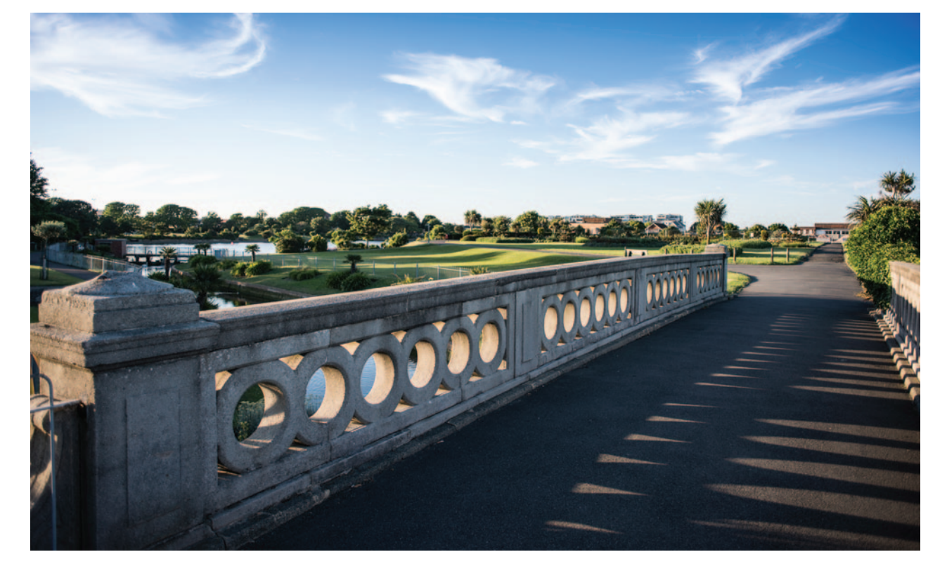
RIGHT Princes Park, Eastbourne