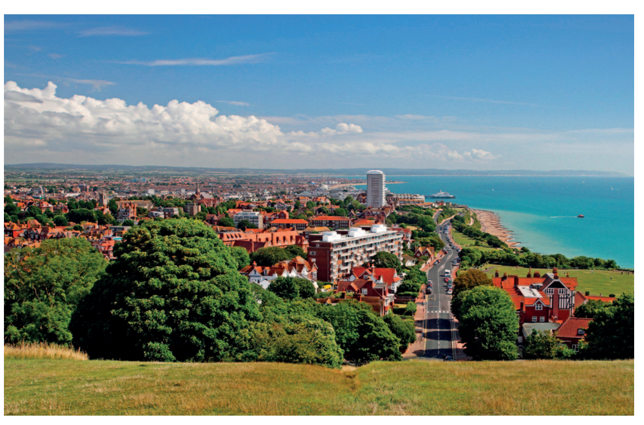
RIGHT View from outskirts of Eastbourne